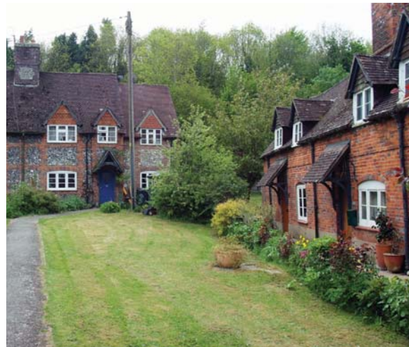
▲ Mill cottages in Laverstoke Lane